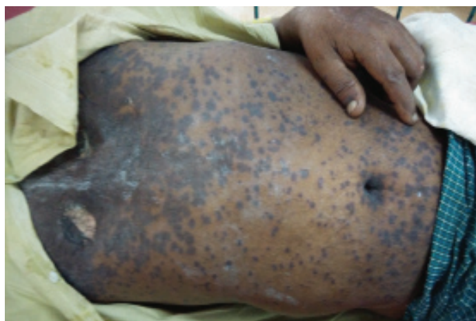
[Table/Fig-2]: Targetoid lesions over the face, trunk and abdomen as initial manifestation