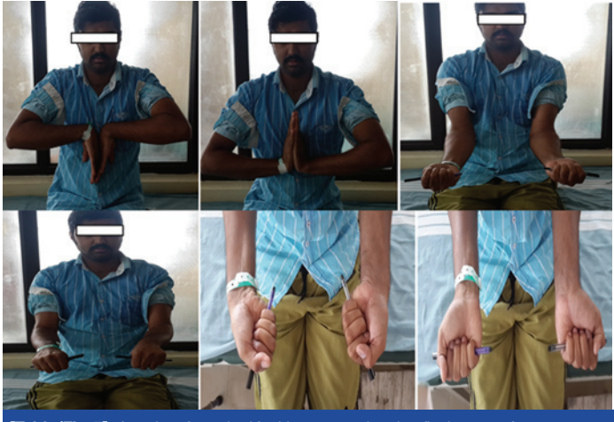
[Table/Fig-7]: A patient from the K-wiring group showing final range of movements