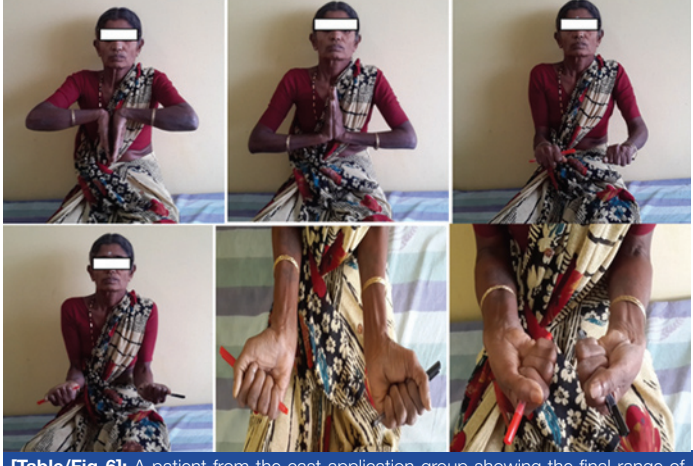
[Table/Fig-6]: A patient from the cast application group showing the final range or movements