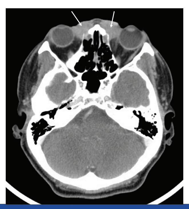
[Table/Fig-2]: CT orbit axial view showing bilateral, symmetrical, enhancing soft tissue mass in antero-medial aspect of the orbit (white arrows)

Granulocytic sarcoma was first described by Allen Burns in 1881, and its association with AML in 1893 [1]. It occurs in 3-9% of patients with AML, either co-existent or prior to the onset of bone marrow leukaemia [2], and is common among children and adolescents.