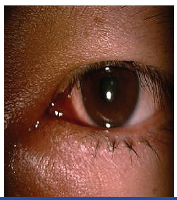
[Table/Fig-1]: Swelling along medial canthal region

The biopsy sample consisted of a circumscribed greyish white firm nodule. Histopathological examination showed conjunctival epithelium with a subepithelial circumscribed cellular tumour composed of closely packed sheets of mitotically active medium-sized polygonal cells with moderately pleomorphic oval to irregular nuclei with dispersed chromatin, small nucleoli and scanty to vacuolated cytoplasm. There were no areas of necrosis or haemorrhage.