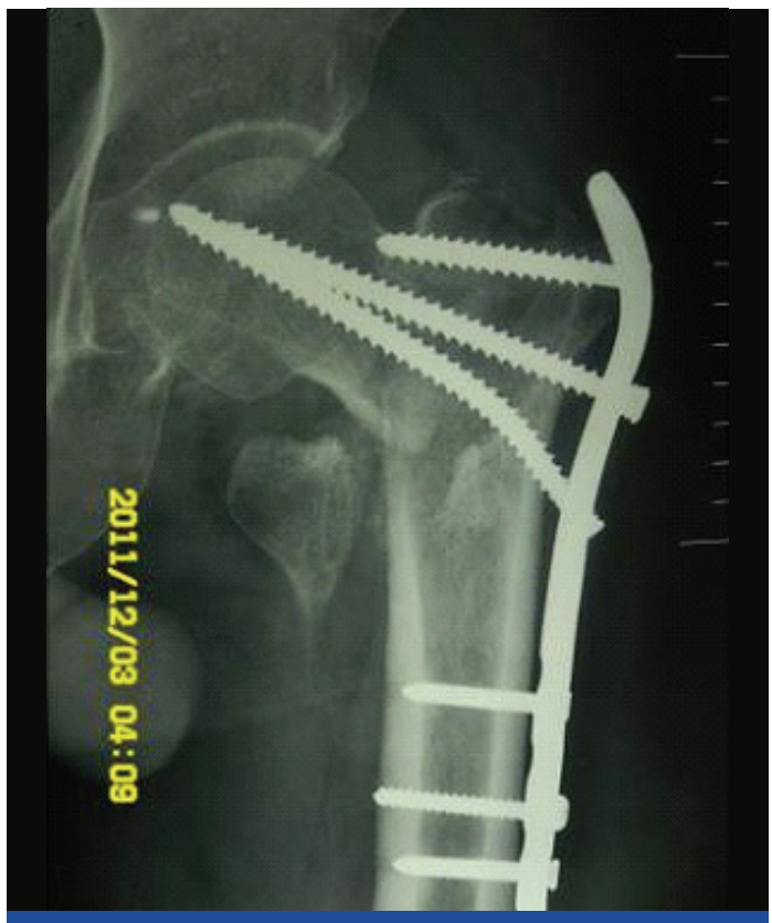
[Table/Fig-8]: Six weeks postoperative radiograph showing varus collapse and bending of proximal screws

Length of incision, operating and fluoroscopy time were favourable in DHS group, but blood loss was less in PFLCP group [Table/Fig-7]. Mean time for mobilization was comparable in both groups.