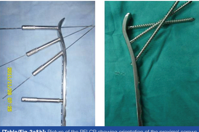
[Table/Fig-3a&b]: Picture of the PFLCP showing orientation of the proximal screws for the head of the femur and the distal combi-holes for locking/cortical screws.

Proximal femoral locked compression plate (PFLCP) is a precontured stainless steel plate specially designed for the left and right femur to accommodate average femoral neck anteversion. The convergent angle design (95°/120°/135°) and the locking interface of the proximal 6.5 mm non-cannulated locking screws should alleviate and improve proximal femoral fixation especially in osteopenic bone. The remaining 4–16 screw holes, in the plate shaft, are LCP combi-holes, which allow the placement of either a cortical or a locking head screw [Table/Fig-3a,b]. This provides the surgeon with the flexibility to achieve plate-to-bone apposition as well as axial compression or angular stability. After achieving closed reduction in most of the cases, plate can be applied by minimally invasive percutaneous plate osteosynthesis (MIPPO) Technique. In another group 135 degree angled dynamic hip screw (DHS) was used for fracture fixation after obtaining close/open reduction.