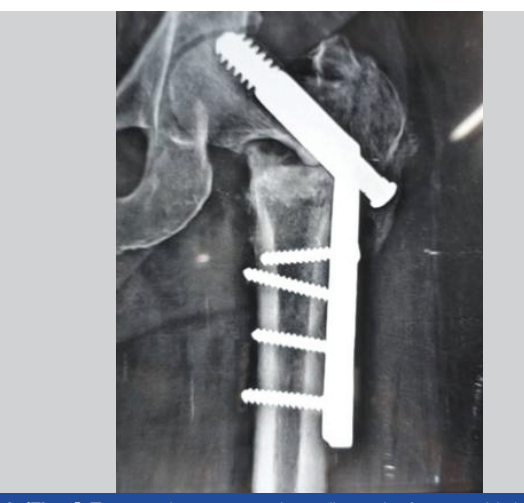
[Table/Fig-1]: Two months postoperative radiograph of an unstable intertrochanteric fracture fixed with DHS showing varus collapse, medialization of the distal fragment and cut out of the femoral head screw.

17% has been reported [9]. The current dictum for intertrochanteric fractures is "No Lateral Wall, No Hip Screw" [10]. Due to the absence of a lateral osseous buttress, there is uncontrolled collapse with medialization of the femoral shaft and lateralization of the proximal femoral fragment if a dynamic hip screw (DHS) is used, which results in varus collapse, femoral head screw cut out and nonunion [Table/ Fig-1].