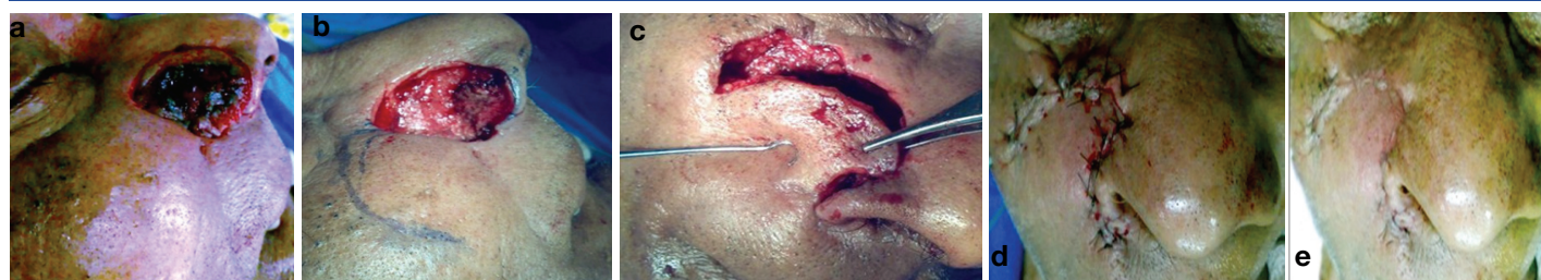
[Table/Fig-2]: (a) Lesion on the nose (b) Lesion excised (c) Nasolabial flap rotated into the defect (d) Nasolabial flap sutured (e) Postoperative