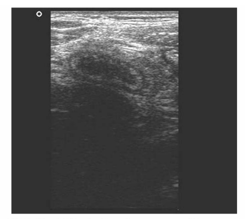
[Table/Fig 1] Tubular enlarged hypoechoeic edematous appendix.

diagnosis, laparotomy findings and resulting histopathological examination (HPE).