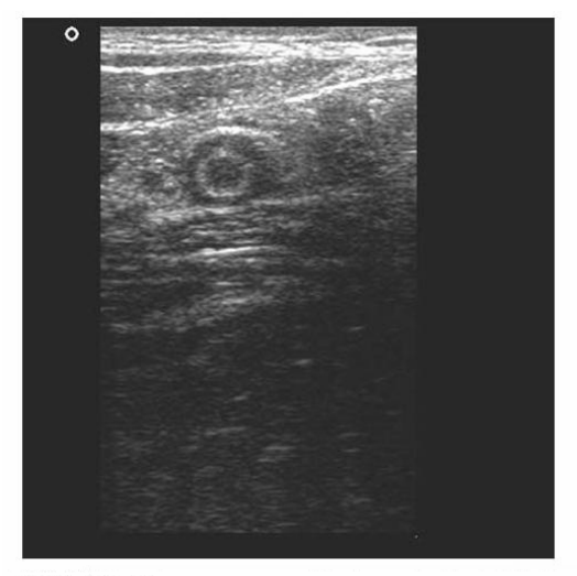
[Table/Fig 2] Inflamed appendix with target sign on USG.