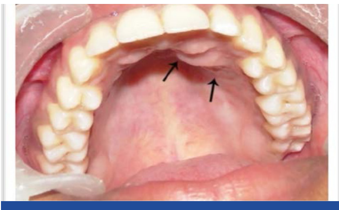
[Table/Fig-1]: Anterior hard palate showing an ill defined swelling in the left lateral incisor – canine region

Detailed clinical examination revealed no visible facial swelling. On intraoral examination, an ill defined, solitary swelling of approximately 1x3 cms was observed in the left lateral part of the anterior hard palate in relation to the lateral incisor and canine [Table/Fig-1]. On palpation, it was non-tender and bony hard in consistency with no fluctuation or softening in any part of the swelling. History of trauma was negative. Maxillary anterior teeth were normal and responded positively to electric and thermal pulp vitality tests. This eliminated the possibility of periapical cyst (due to pulpal inflammation) or an odontogenic cyst to be the cause of the swelling. Hence, a preliminary diagnosis of an odontogenic tumour was made, Keratocy stic odontogenic tumour, Central odontogenic tumour, central hemangioma, Osteoporotic bone marrow defect, Neurofibroma and Neurilemmoma were the specific lesions considered in the differential diagnosis.