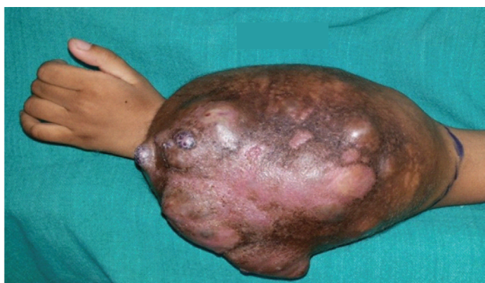
[Table/Fig-1]: Haemangioma involving the left forearm

Haemangioma is a common condition in pediatric age group [1,2], thus anaesthesiologists are expected to encounter patients with hemangioma frequently. KMS is a rare clinical manifestation in patients with haemangioma, moreover its clinical features are diverse [1-7]. Although this particular case did not pose much challenge in the perioperative period, this discussion should serve to remind anesthesiologists of the possible complications and management issues that may be encountered with KMS.