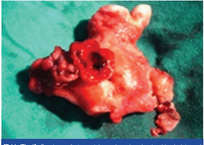
[Table/Fig-1]: Specimen of uterus, tube and ovaries showing blood clots and attached right ovary over posterior surface of uterus

Our case fulfilled all the four criteria of Spiegelberg (1878) for the diagnosis of ovarian pregnancy: (a). The tube has to be entirely normal (b). The gestational sac has to be anatomically situated in the