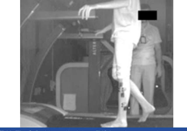
[Table/Fig-4]: Participant with wireless sEMG for testing peroneus longus muscle activation in stance phase of gait.

at a sampling rate of 500 Hz. The Root-Mean Square (RMS) amplitude for peroneus longus muscle burst was calculated as follows: the raw EMG signals were full-wave rectified, band-pass filtered with a hamming window to remove movement artefacts with a cut-off frequency of 40 Hz to 500 Hz, and smoothed with a 50 millisecond RMS algorithm. The myo-synch was used to synchronise the myo-pressure instrumented treadmill and myo-muscle sEMG. Testing was recorded to identify the injured and non-injured leg gait parameters by maintaining at 2 km/ hour speed and the muscle activation of peroneus longus was recorded during stance phase of gait as shown in [Table/Fig-4].