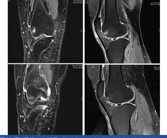
[Table/Fig-3]: Showing MRI of knee in coronal and sagittal views; before intraarticular PRP injection in the upper row and 18 months post PRP injection in the lower row showing a comparatively thickened articular cartilage.

A total of 50 patients with mild to moderate OA knees were involved in the study and completed a minimum of 9 months post PRP injection follow up. Gender wise 28 females and 22 males were involved