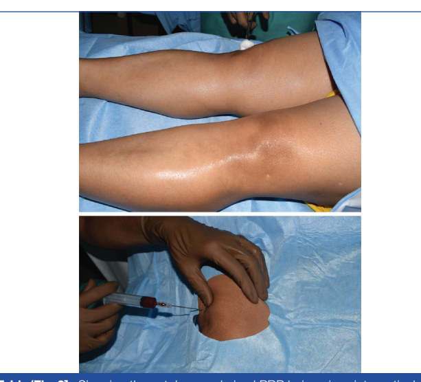
[Table/Fig-2]: Showing the autologous derived PRP being given intra-articular into the knee under sterile aseptic conditions.

The WOMAC pain index is a disease-specific questionnaire for the disease, which assesses pain, stiffness and physical functions of patients. After receiving the approval for study from our hospital's Ethics Committee, the aims and methods of PRP therapy as well as the benefits and the possible adverse effects of study were presented to the patients. Then, for each patient, WOMAC questionnaire for evaluation of patients' pain, stiffness and physical functions was recorded and evaluated. Patients were evaluated before the PRP treatment and after the treatment at 1 month, 3 months and 9 months with WOMAC questionnaire. Under strict aseptic precautions about 6 mL of the autologous PRP preparation was injected intra-articular with a 21 gauge hypodermic needle behind the patella after synovial fluid aspiration in the affected knee [Table/Fig-2]. Acetaminophen was given for pain relief and physiotherapy started from next day with guadriceps and hamstrings strengthening exercises. Similarly another dose of PRP injection was given after a week interval. Longest follow up was of 18 months, which had also MRI knee imaging done pre and post PRP intervention. T2W images showed increased thickness of articular cartilage in both coronal and sagittal images [Table/Fig-3].