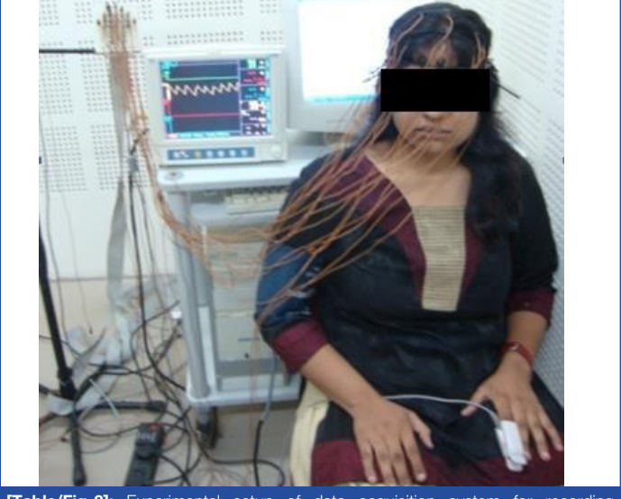
[Table/Fig-3]: Experimental setup of data acquisition system for recording electroencephalogram (EEG) signals.

The induced emotion can also be determined by evaluating the ANS activity as these changes will stimulate the periphery organs and can be evaluated by measuring Heart Rate (HR), Blood Pressure (BP), Cardiac Output (CO), Total Peripheral Resistance (TPR), Stroke