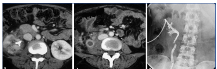
[Table/Fig-2]: Contrast CT done after a month shows; a) small renal parenchymal air foci; and; b) minimal infrarenal fluid collection; c) Conventional Nephrostogram shows no evidence of pyeloduodenal fistula.

The patient is doing well at 12 months of follow up. Ultrasonography showed complete resolution of the collection. Serum creatinine was 1.1 mg/dL and Glomerular Filtration Rate (GFR) was 16 mL/min for right kidney and 45 mL/min for the left kidney.