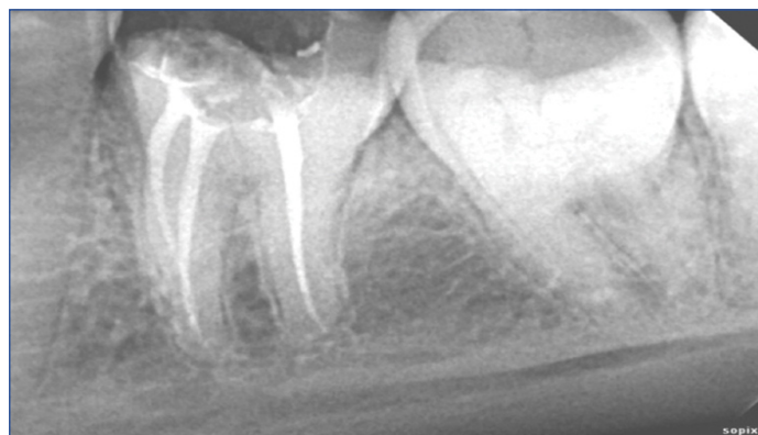
[Table/Fig-2]: Peri-apical radiograph of tooth 36 immediately after obturation.

In the first visit pulpal anaesthesia in tooth 36 was gained by conventional Inferior Alveolar Nerve Block (IANB) using 2.5 mL of 2% lignocaine with adrenalin (1: 2, 00,000) (LIGNOX 2% A, Indoco Remedies Ltd., Gujarat, India). Instrumentation was performed with manual K files (Dentsply Maillefer) by crown down pressureless