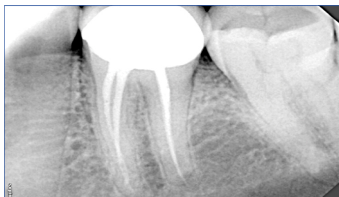
[Table/Fig-3]: Peri-apical radiograph of tooth 36, six months after obturation.

technique. The canals were irrigated sequentially with every change of file using 5 mL of 3% sodium hypochlorite (Parcan, Septodont Healthcare India Pvt., Ltd., Raigad, Maharashtra, India), 5 mL of 17% EDTA (Pulpdent corporation, Watertown, Massachusetts, USA) for 60 seconds followed by 5 mL of saline (Baxter India Pvt., Ltd., Mumbai, India) for 120 seconds. Cavity was temporarily restored with type II GIC (G.C. corporation, Tokyo, Japan) restoration after using \text{Ca(OH)}_2 (Sultan healthcare Inc, Englewood, NJ, USA) as intracanal medicament. The patient was not prescribed any drugs.