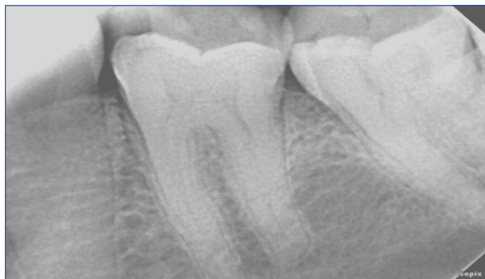
[Table/Fig-1]: Preoperative peri-apical radiograph of tooth 36 showing widening of periodontal ligament space and peri-apical radiolucency.

A 36-year-old male patient reported to a private dental office with acute pain in left mandibular region. Based on the symptoms, clinical findings (deep cavitated lesion), diagnostic tests (percussion test, pulp sensitivity test) and investigations (IOPA) [Table/Fig-1] it was diagnosed as a case of symptomatic irreversible pulpitis with apical periodontitis in tooth 36 and the treatment plan was endodontic therapy in relation to 36 followed by post-endodontic restoration.