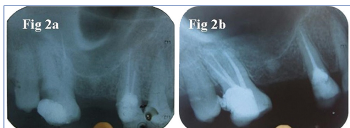
[Table/Fig-2]: a) Preoperative radiograph showing fractured instrument external beyond apex of mesiobuccal root of maxillary second molar, b) Postoperative radiograph during follow up.

patient with fractured endodontic instrument beyond apex of mesiobuccal root of maxillary second molar through maxillary sinus. An endodontic procedural error led to instrument fracture at the apex of mesiobuccal root of maxillary second molar. This caused low grade periapical inflammation leading to dull constant pain in the patient. It was imperative to retrieve the fractured fragment as it had perforated the sinus membrane to reach the sinus. The retrieval of fragment was achieved by gentle lifting of the sinus membrane. As the perforation was only a pinpoint perforation by the instrument