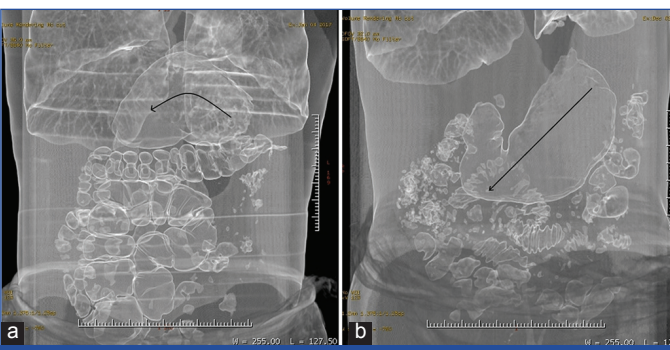
[Table/Fig-2]: Computed tomography volume rendered reconstructed image showing: a) Twisting of the stomach (curved black arrow) along the long axis, consistent with organoaxial type of volvulus; b) When compared to the usual normal axis of the stomach (straight black arrow) taken from another patient.

found difficult. However, on withdrawal from the duodenum, the orientation of stomach appeared normal. A possibility of gastric volvulus was considered and a contrast-enhanced computed tomography of abdomen was done. This it showed inversion of greater and lesser curvature, with gastric rotation along the long axis consistent with an organoaxial type of gastric volvulus [Table/Fig-2] [1]. The patient underwent gastropexy and was symptom free on follow up. Chronic gastric volvulus is a rare and often